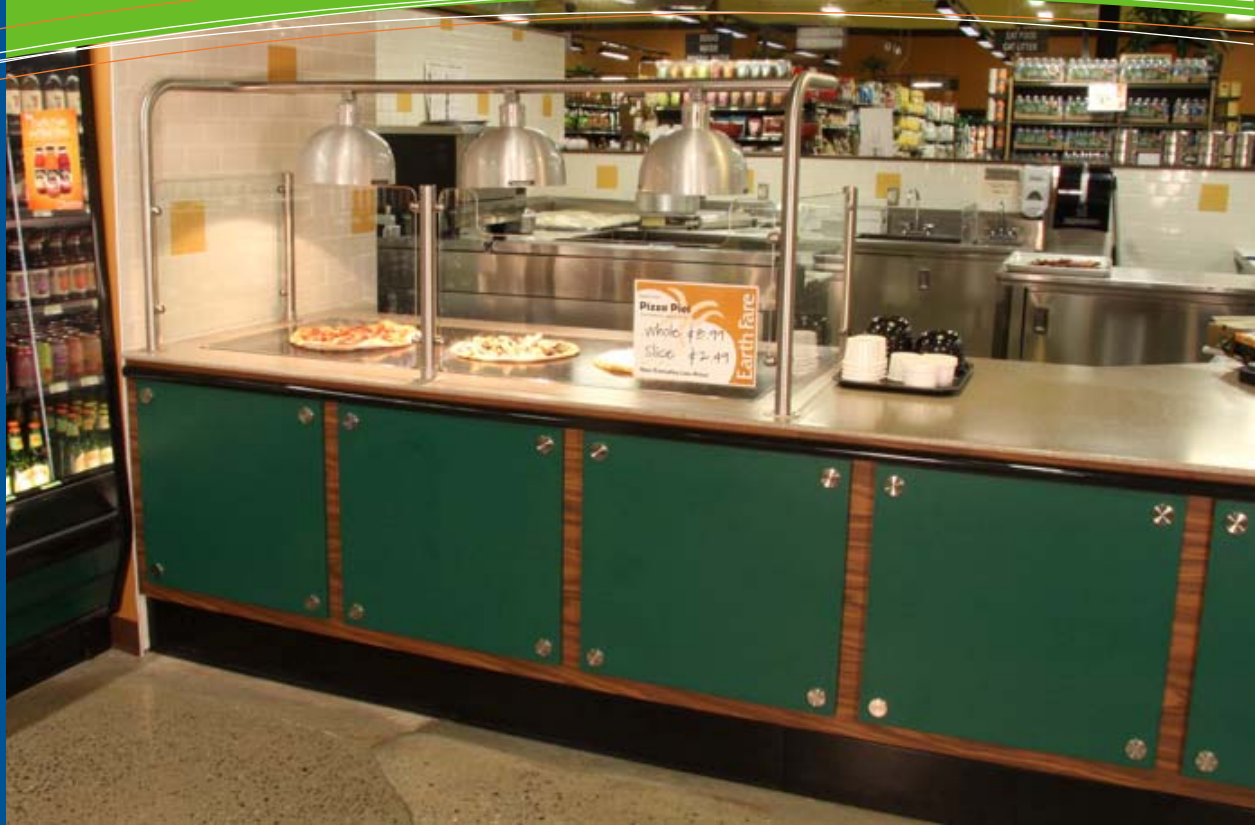
Inline module for heated drop-in surface