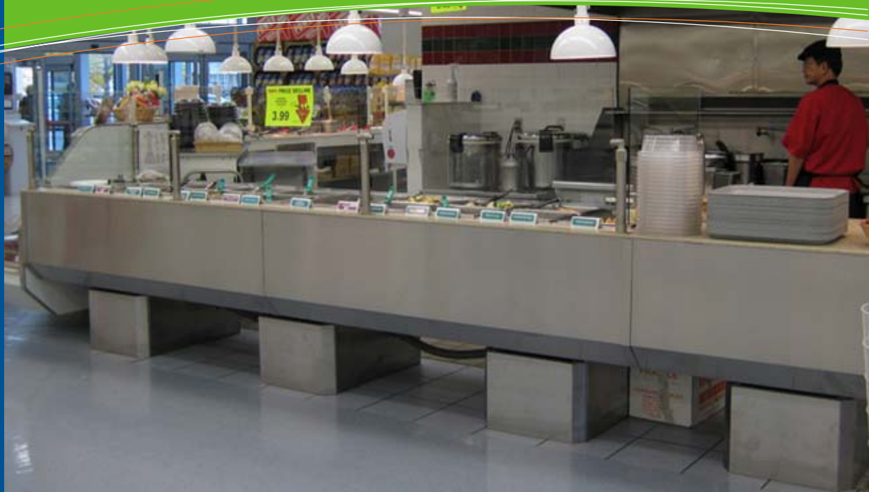
Inline module for heated drop in pans.