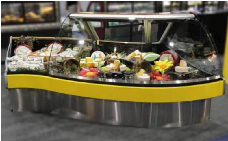
Low-Capacity G Series Service & Self-Service lineup

“Future Ready” ~ all G Series units meet the Department of Energy’s 2012 Energy Efficiency Standards!