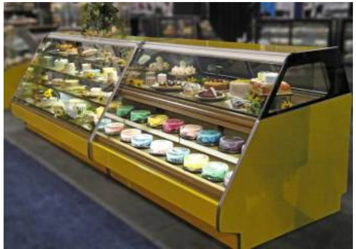
High-Capacity G Series Service & Combination lineup

featuring EnergyWise refrigeration system