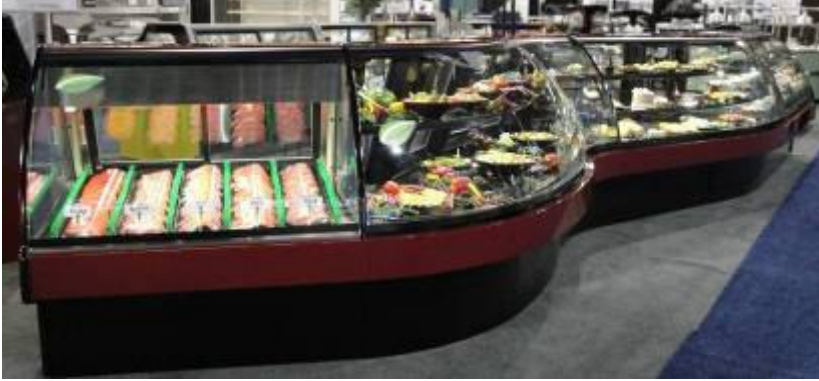
Mid-Capacity G Series Deli & Bakery Service lineup

We introduced our new G Series display cases for Deli, Meat/Seafood and Bakery merchandising.